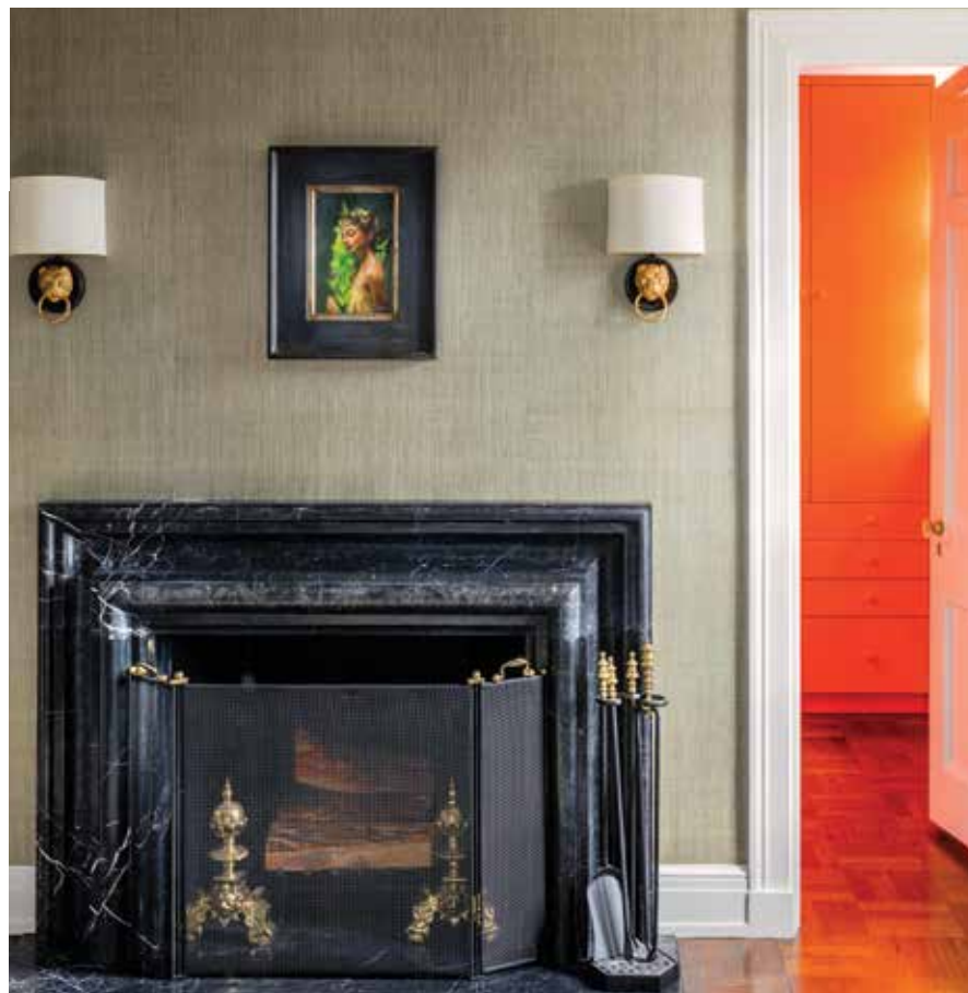
ABOVE: Art deco lines repeat in the primary bedroom, where a headboard feels architectural alongside a mirrored nightstand that holds a jewel-like lamp. BELOW: Lion-head wall lights from Vaughan flank the fireplace in the primary bedroom, while the walk-in closet glows Hermès orange. FACING PAGE: On the private roof-deck, the couple can soak up 360-degree views from their teak Casa Design Group chairs.

INTERIOR DESIGN: Duncan Hughes, Joanne Nhip, Duncan Hughes Interiors