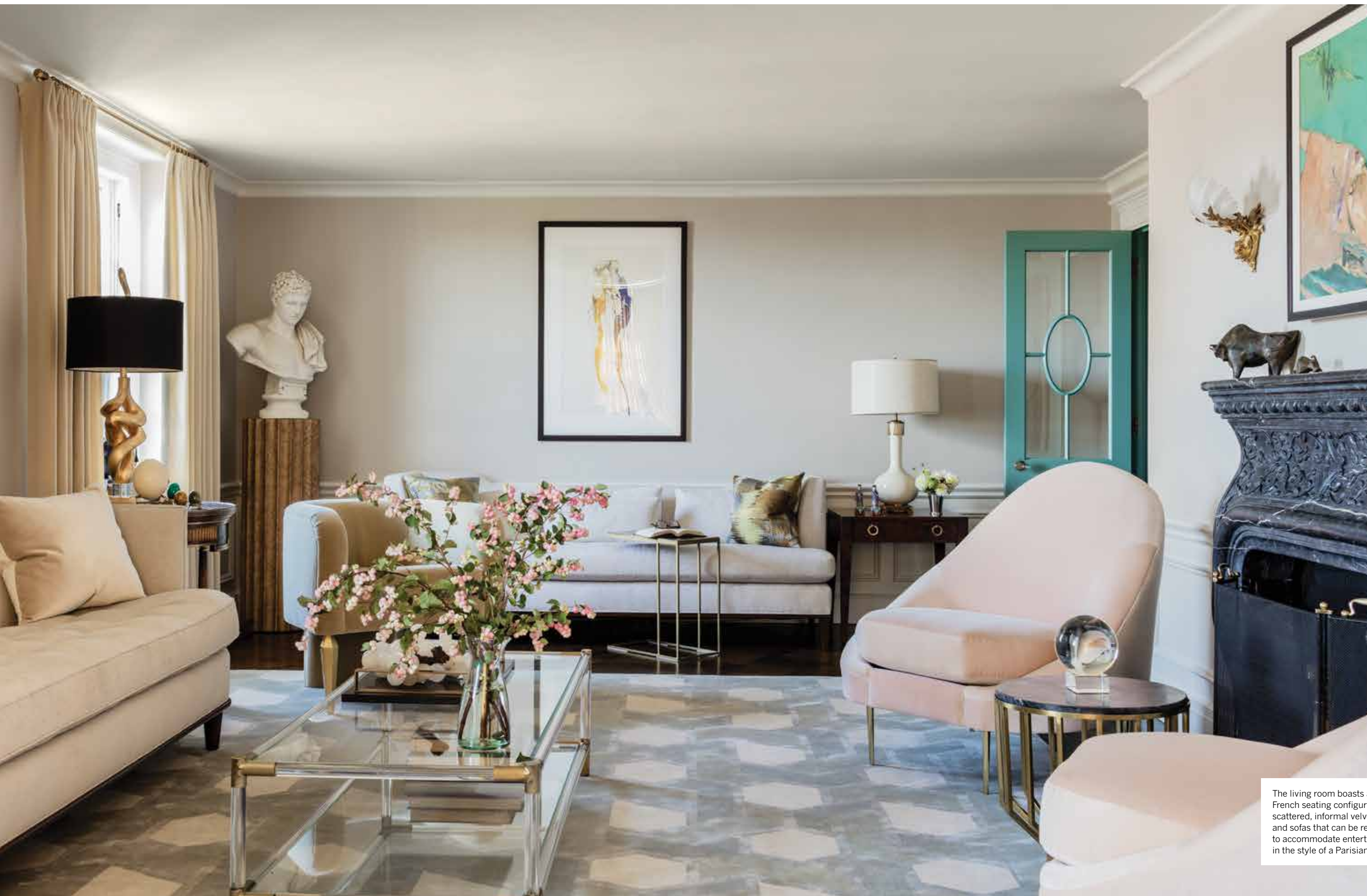
The living room boasts a very French seating configuration with scattered, informal velvet chairs and sofas that can be rearranged to accommodate entertaining in the style of a Parisian salon.